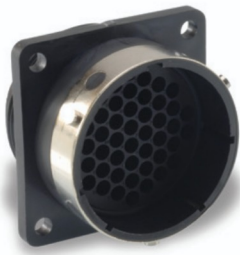
Reversed Receptacle for Pin Contacts