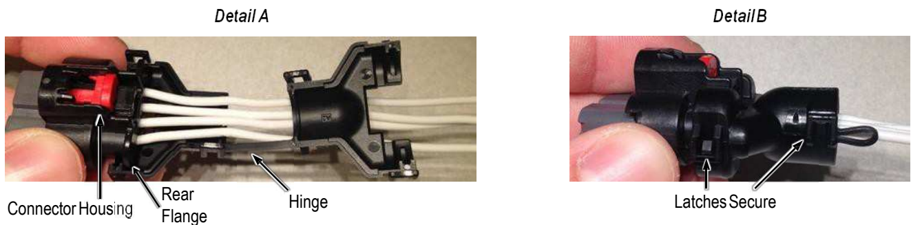
Figure 2: Straight Exit