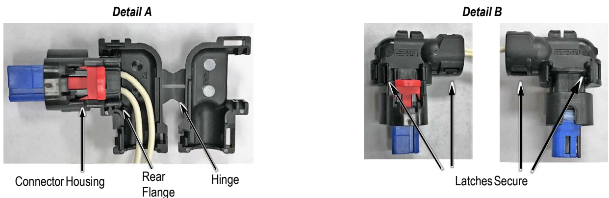
Figure 3: Right-Angle Exit

NOTE: Using the wire dress cover in any manner other than the intended production process can allow the hinge of the cover to be manipulated in such a way that causes the latches to “bubble” and not be fully secured.